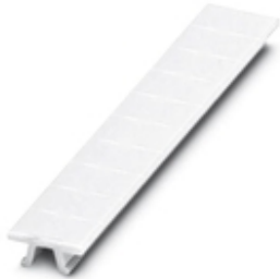
Zack marker strip, 10-section, vertically labeled with the consecutive numbers: 1 ... 10, white, width: 6 mm

Please be informed that the data shown in this PDF Document is generated from our Online Catalog. Please find the complete data in the user's documentation. Our General Terms of Use for Downloads are valid ( http://phoenixcontact.com/download )